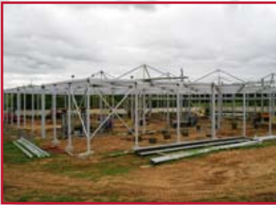
Volokolamsk, Moscow region. Paste manufacturing plant