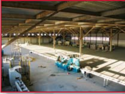
Dorokhovo, Moscow region, Wood Processing plant