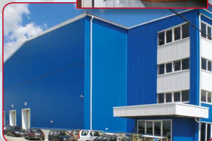
Bakovka, Moscow region. S=4000 sq.m