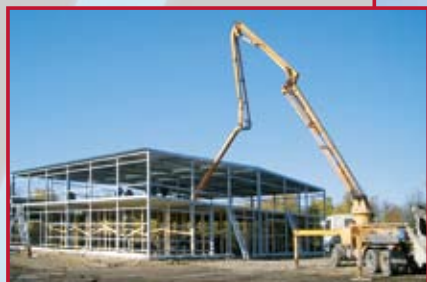
Car trading center in Noginsk Moscow region