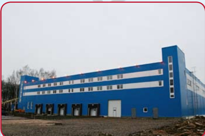
Administrative and warehouse complex S=8000 sq.m. Klimovsk, Moscow region.