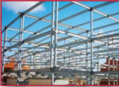
Trade and Entertainment Center "Novakhovo" Nikolo-Uryupino, Moscow region