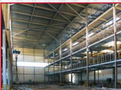
Dedovsk, Moscow region. Textile production