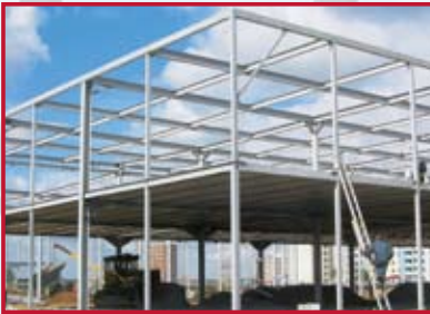
Trade Center "Perekrestok" Lipetsk