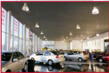
RENAULT Zele- nograd, Moscow region, 17 km from Moscow, S=5000 sq.m.