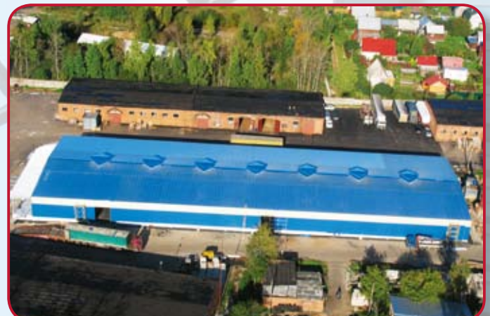
Warehouse S=2000 sq.m. Snegeri, Moscow region.