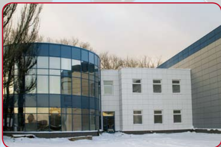
Moscow S=1800 sq.m