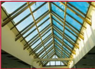
Trade Center "Cherkizovo" Moscow