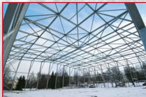
Dmitrov. Tennis court S=2160 sq. m, length – 36 m, height – 12 m.